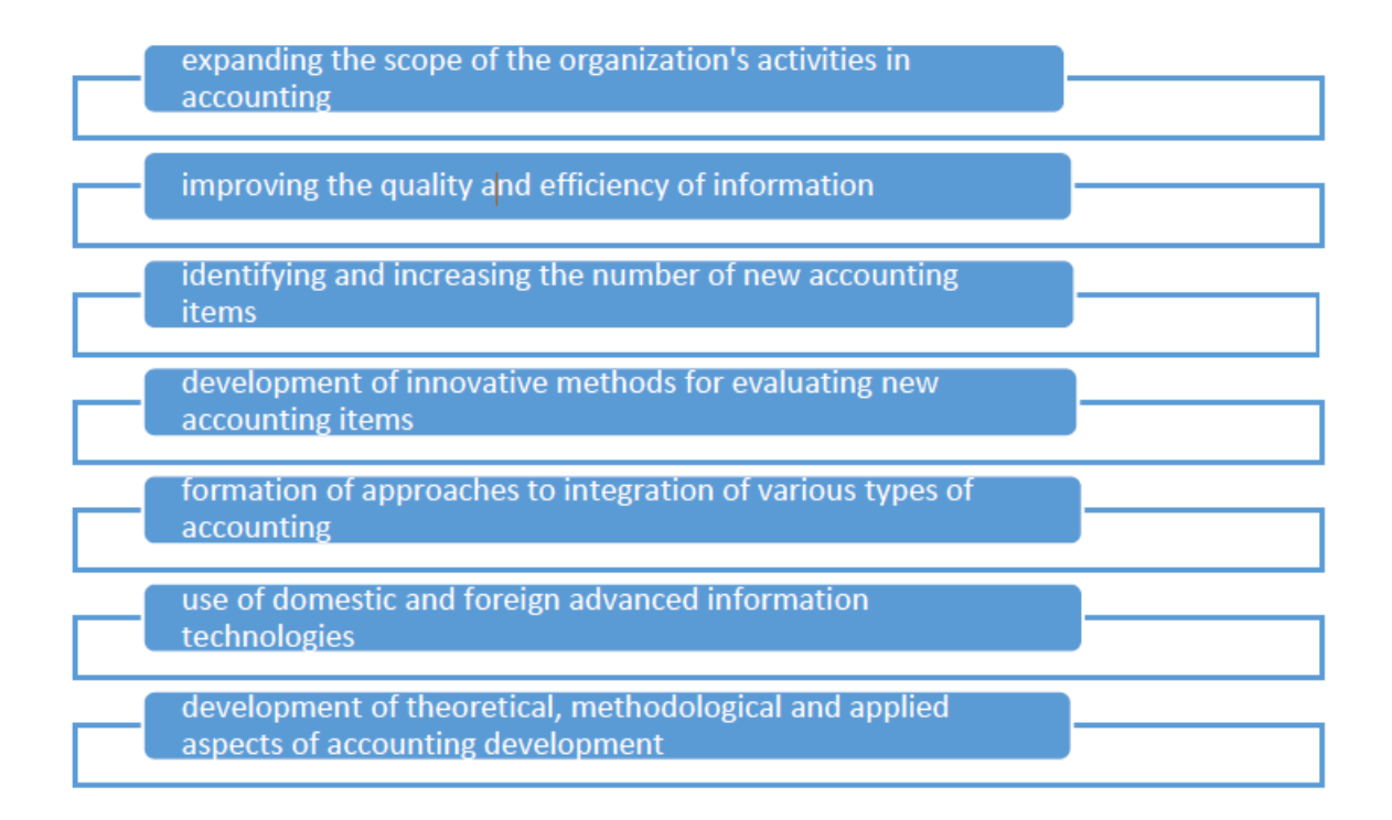
Fig.3. Revise techniques for advancing accounting methodologies