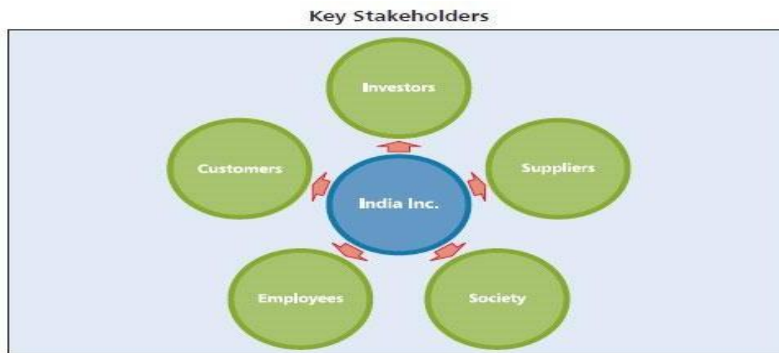
FIG 2.1: Key Stakeholders

CSR is a company's commitment to its stakeholders to conduct business in a socially, environmentally and economically sustainable way that is ethical and transparent. Present day business scenario has changed visibly from the traditional way of focusing on profit to today fulfilling the social responsibility and contributing to the various stakeholders such as employees, investors, customers and community at large who are impacted by their actions. Immense competition and increasing globalization has pushed the companies to fine-tune their strategies and business models to sustain over the long term and CSR is expected to play an important role in the coming years.